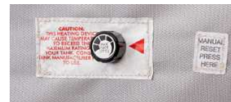
Controls temperature easily with adjustable thermostats