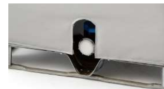
Mouse hole provides easy access to spigot