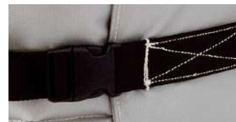
Fits several tote tank sizes with adjustable nylon straps and buckles