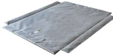
Optional Insulating Cover

Insulation thickness of top cover: 0.25 in (6 mm)