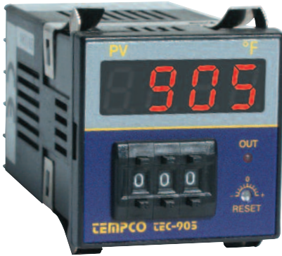
Simple Setpoint and Display!