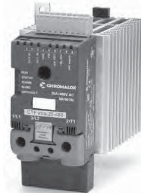
CTF-Xtra 25 A - 60 A